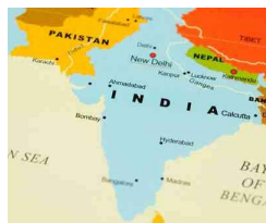
Chinese, Indian coal demand to surge by 2015