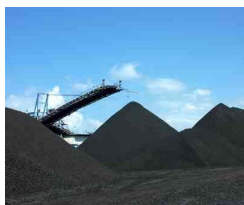
China coal imports to double in 2015, India close behind